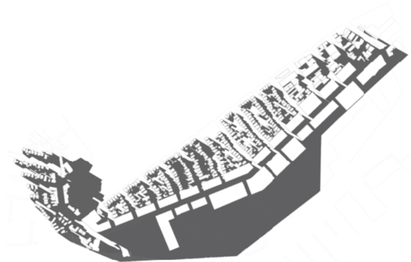
SHA CONDITION : WINTER 5:00 PM