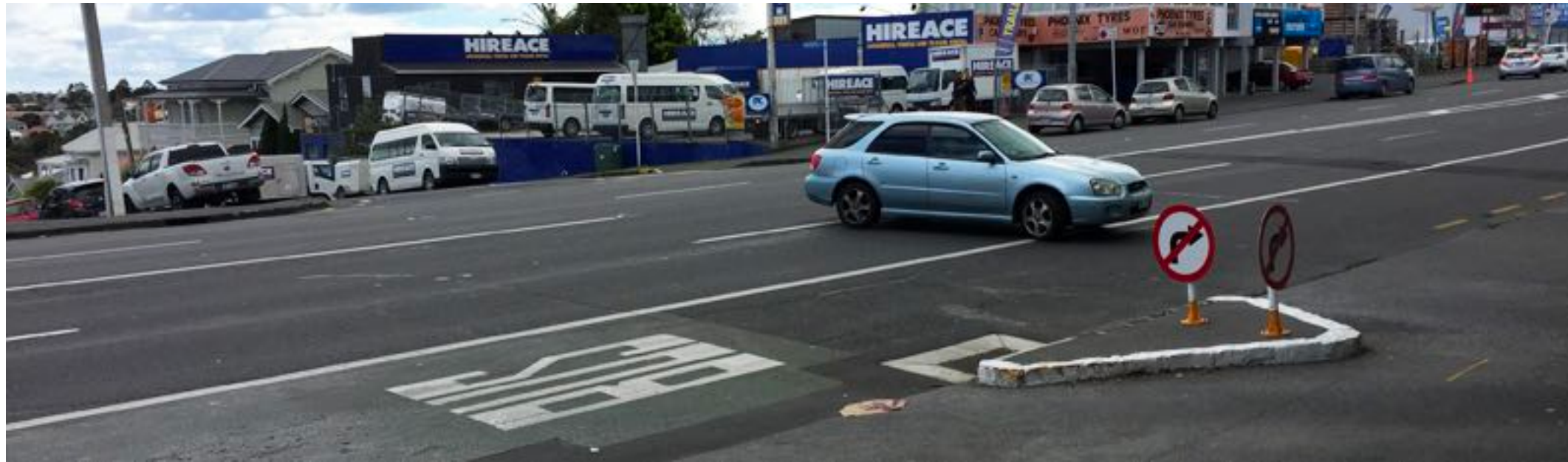
Blue car making the illegal right-turn into Bunnings.