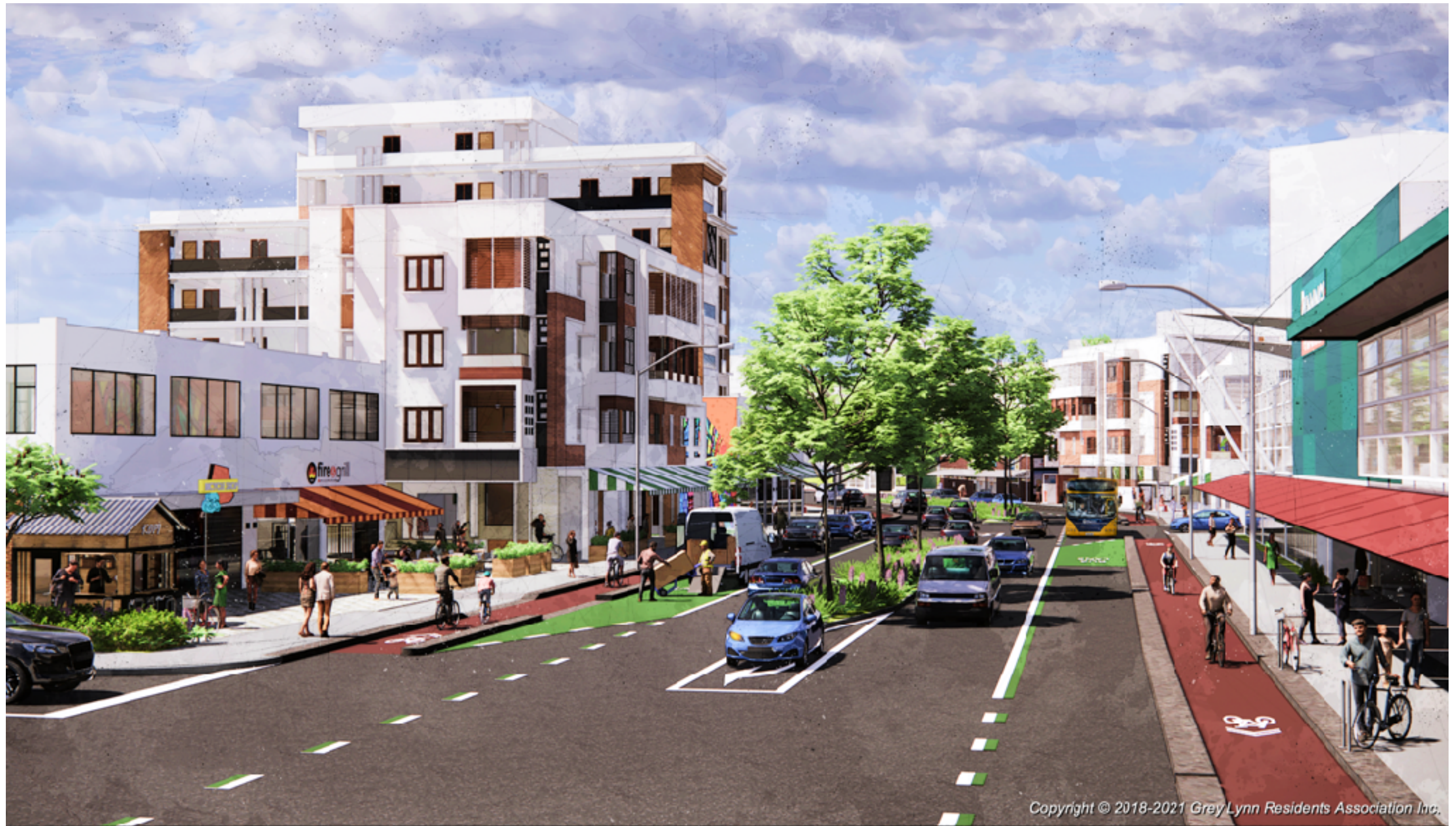
This visualisation of Great North Road depicts how a linear park could work.