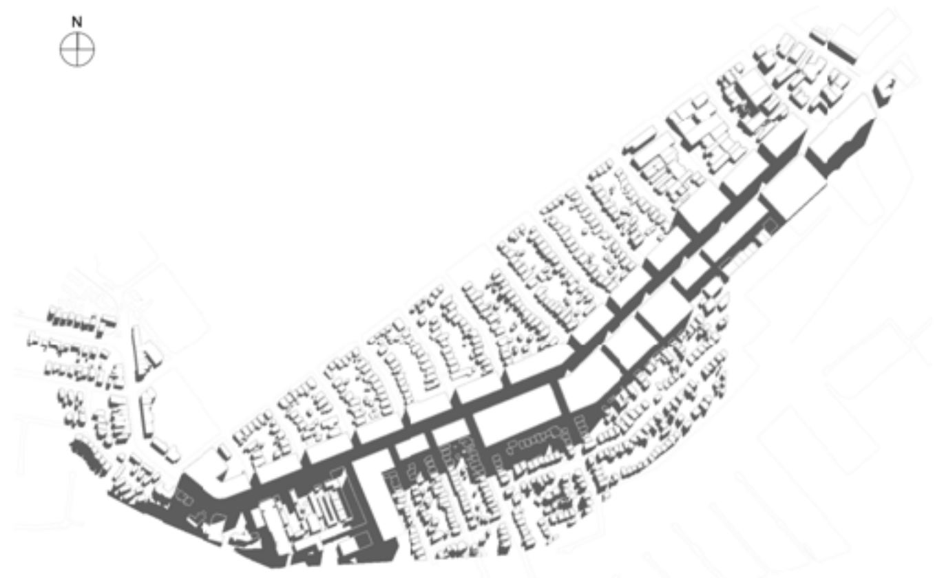
SHA CONDITION : WINTER 11:00 AM