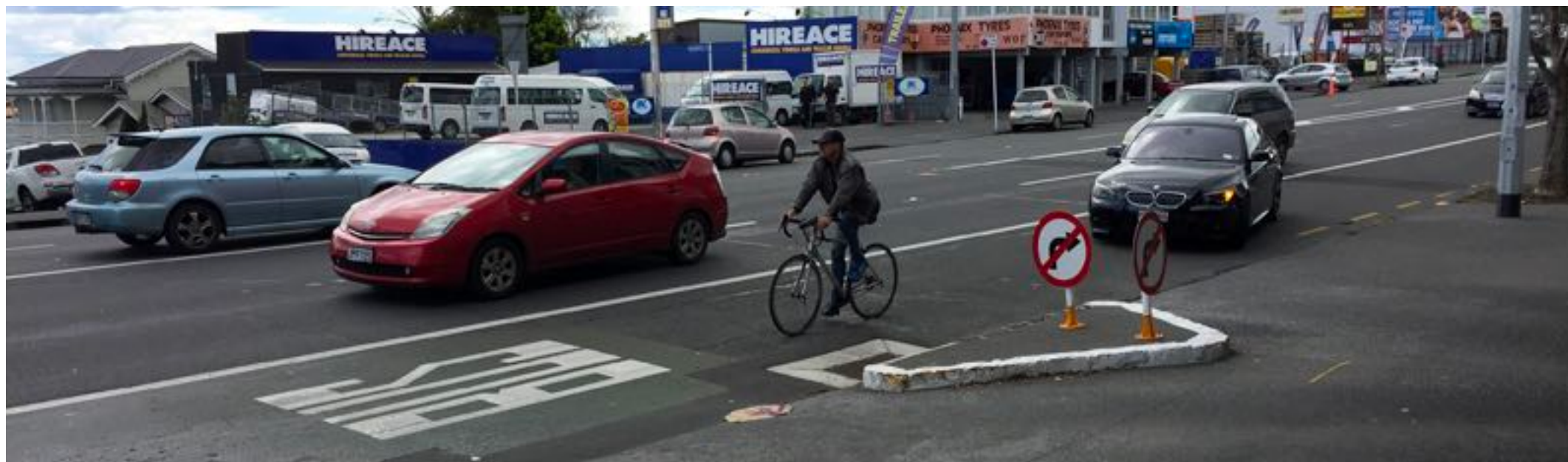
Blue car waiting to make an illegal right-turn into Bunnings.