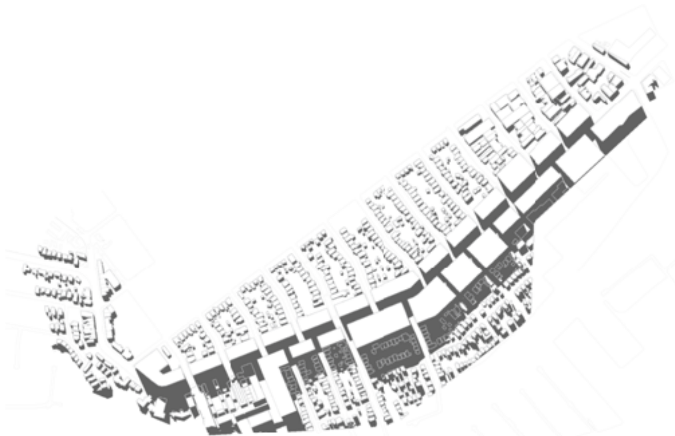
SHA CONDITION : WINTER 2:00 PM