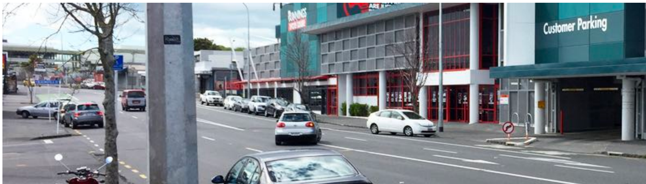
Car making an illegal right-turn into Bunnings.