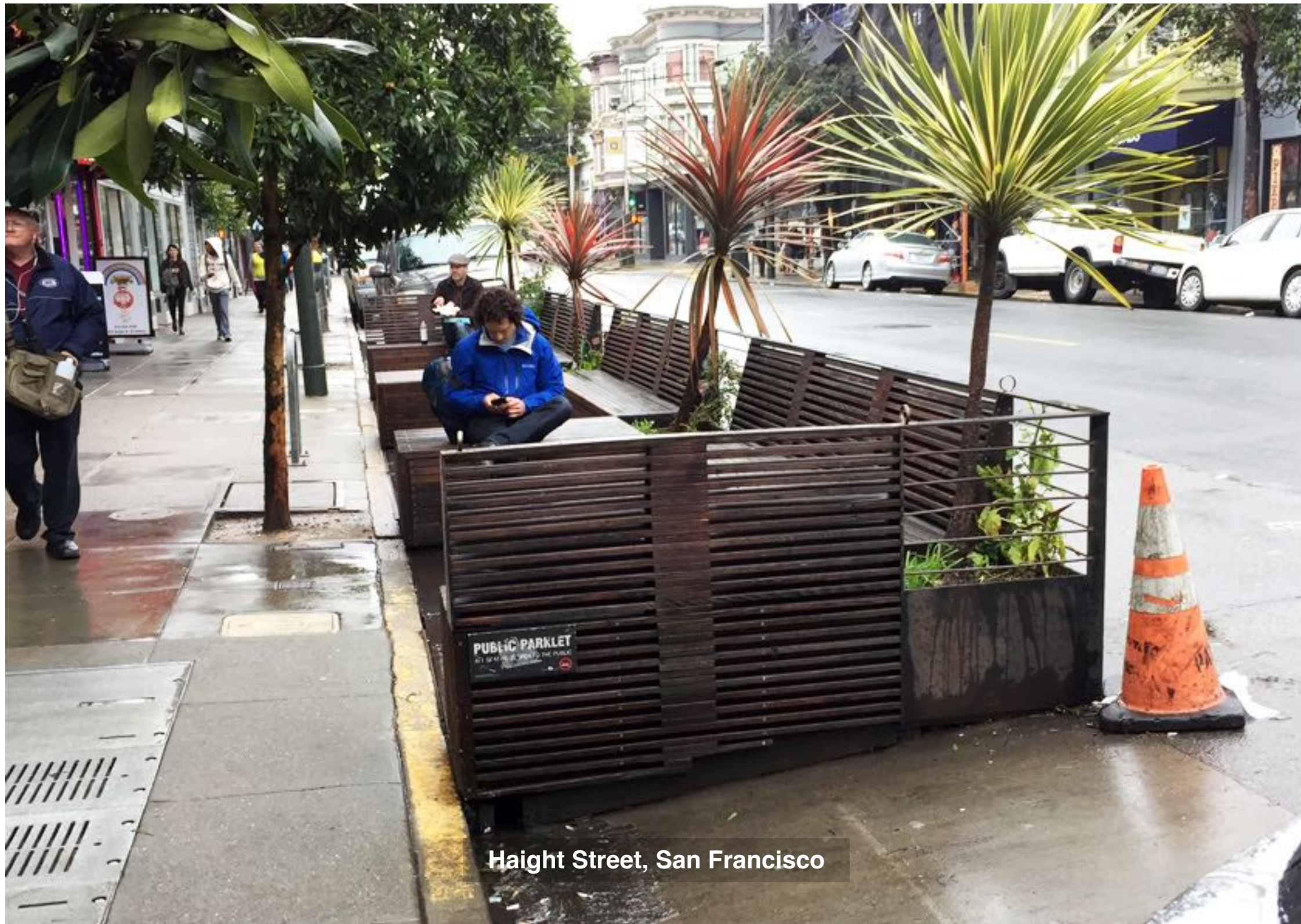
Haight Street, San Francisco