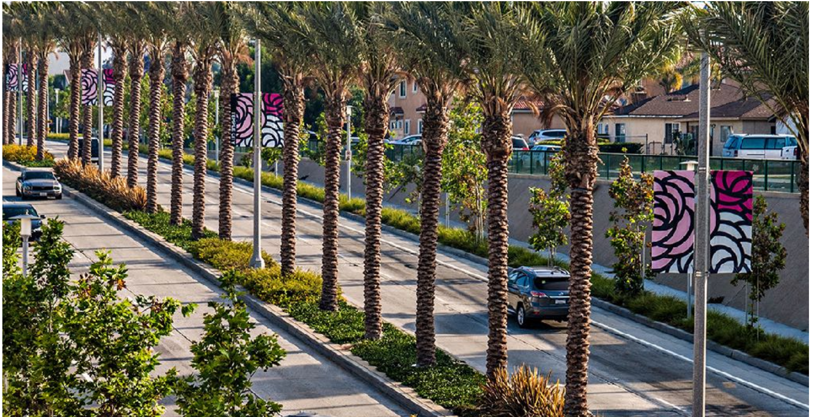
Rosemead Boulevard, Temple City, California