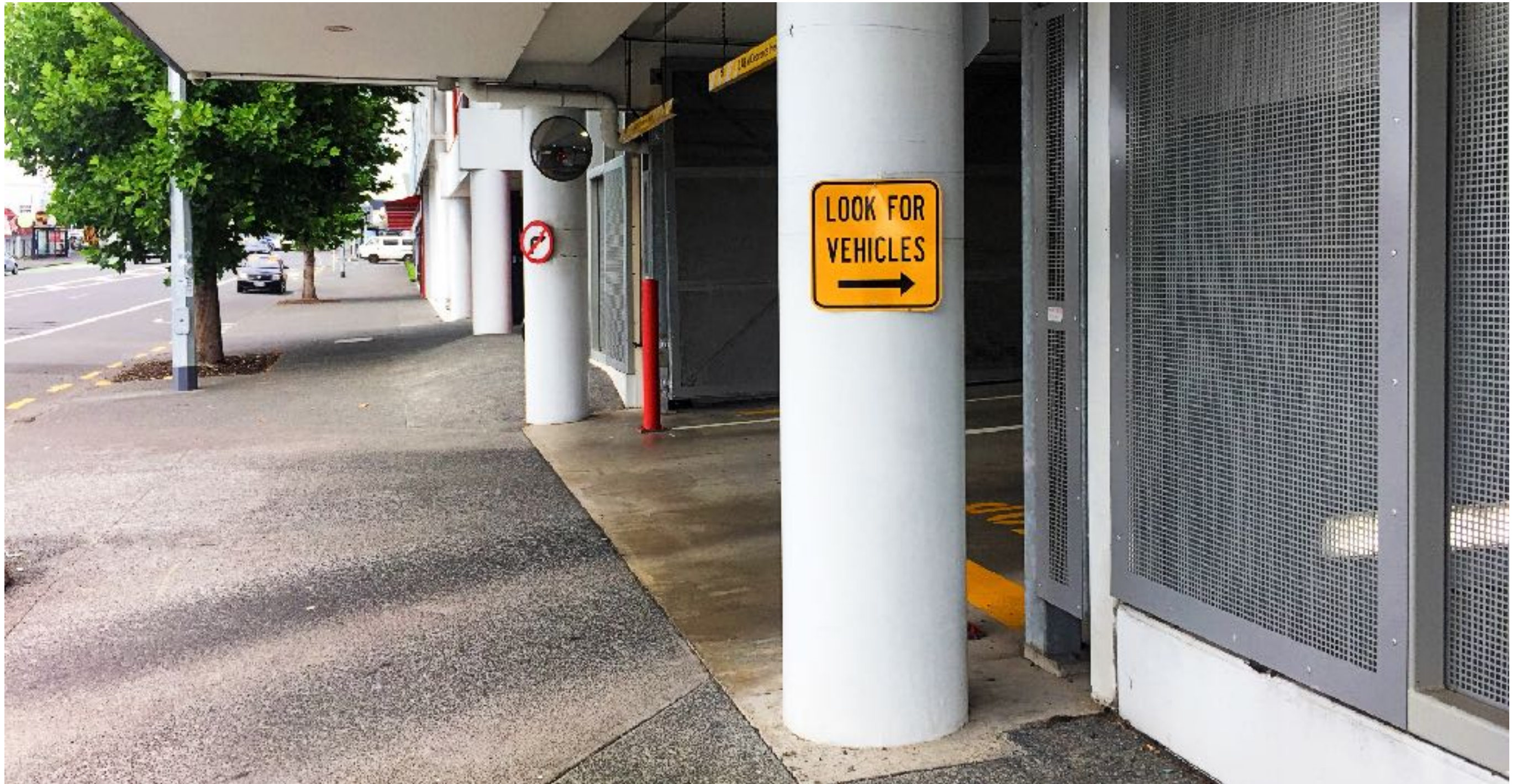
Highly visible sign for pedestrians