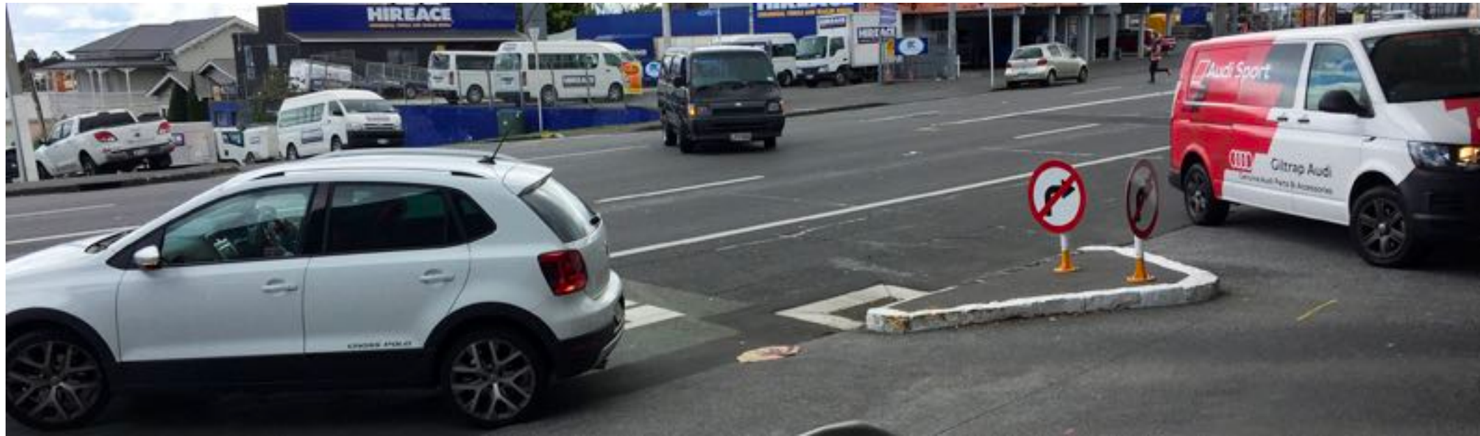
Beaconsfield St traffic competing with Bunnings.