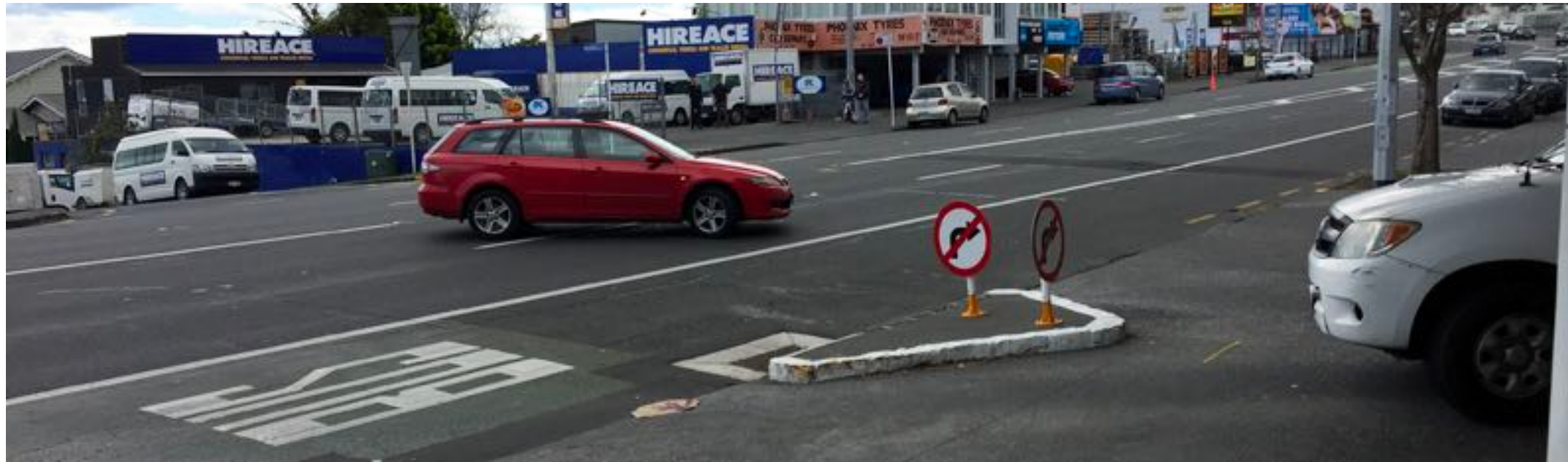
Car making an illegal right-turn into Bunnings.