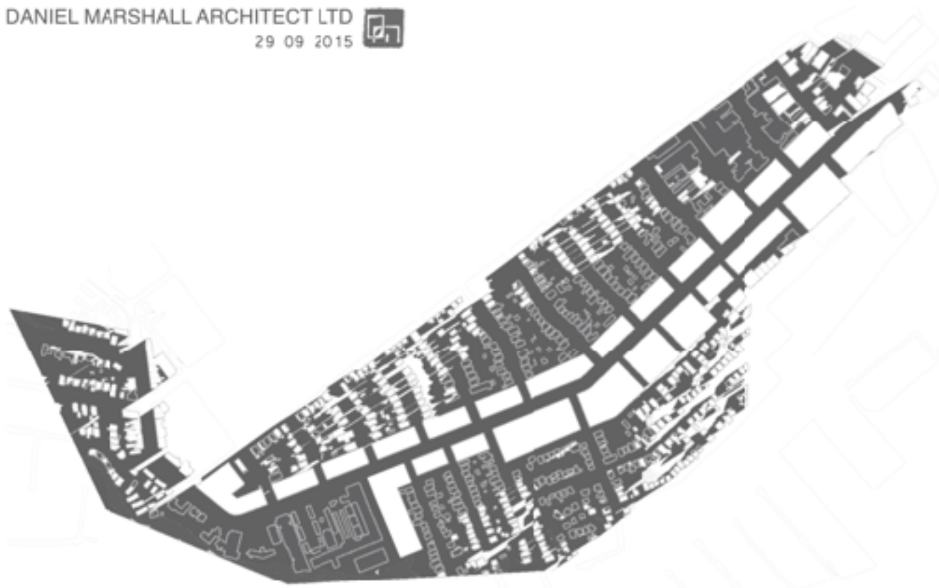
SHA CONDITION : WINTER 8:00 AM