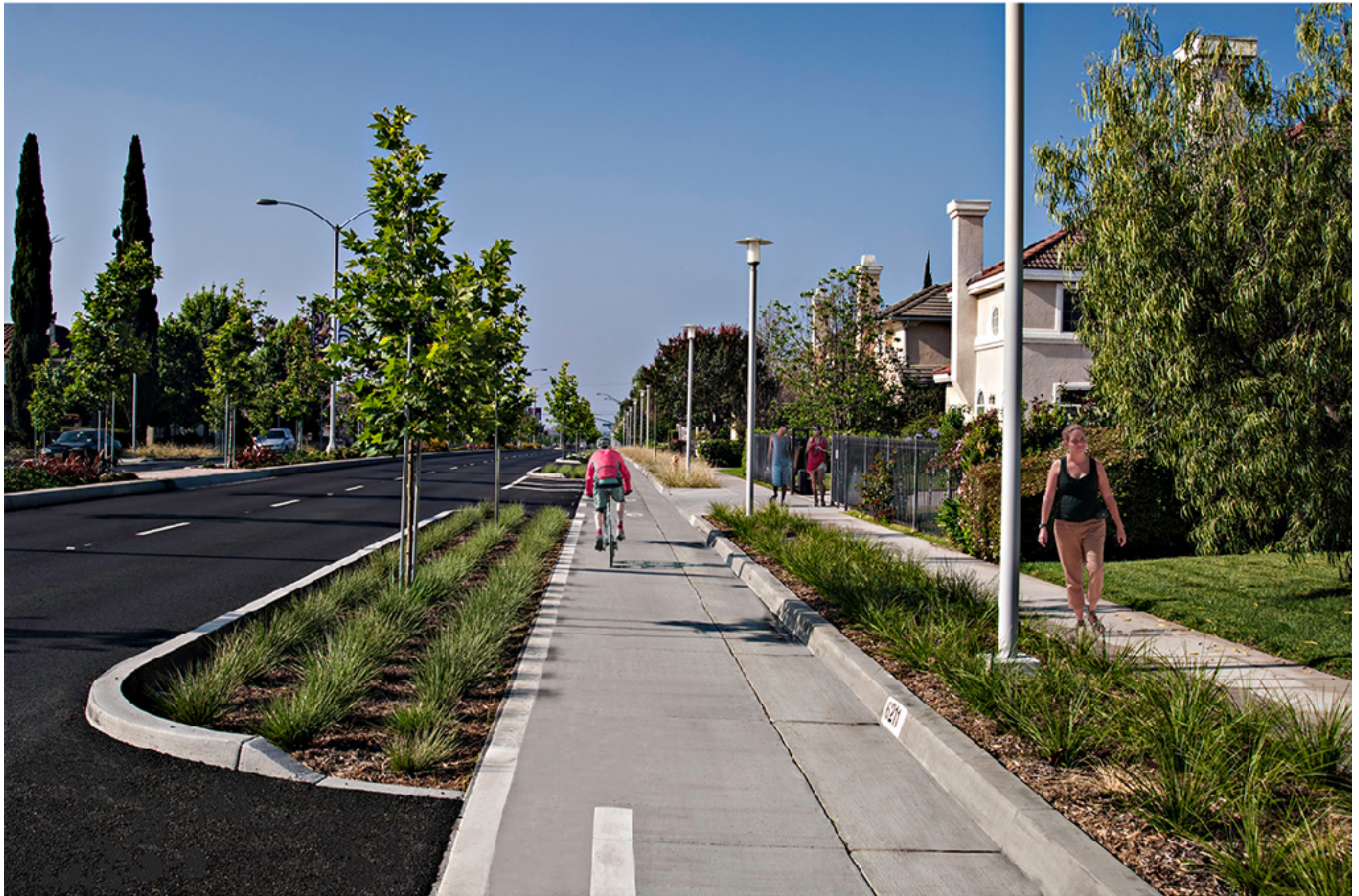
Rosemead cycleway, California