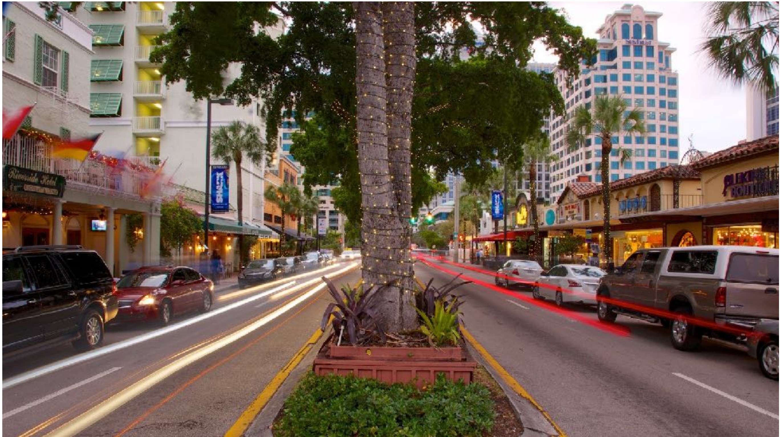
Las Olas Boulevard, Fort Lauderdale, Florida