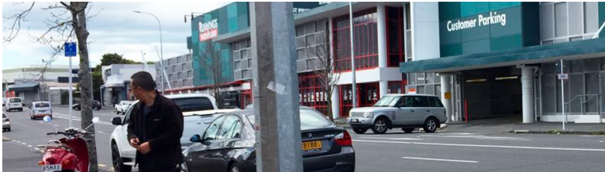
Car making an illegal right-turn out of Bunnings.