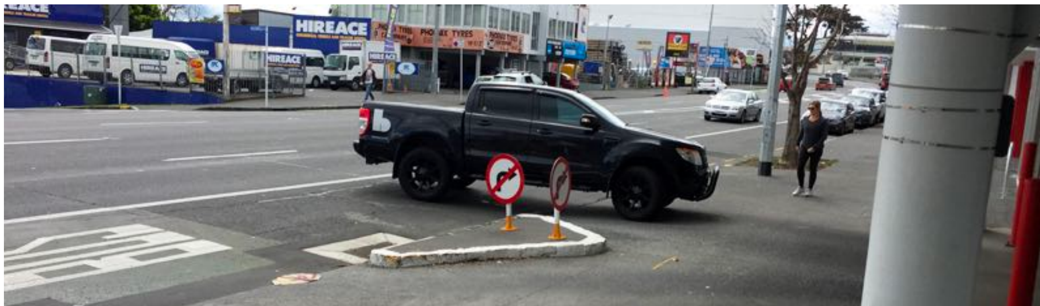
Pedestrian having to give way to illegally right-turning ute.