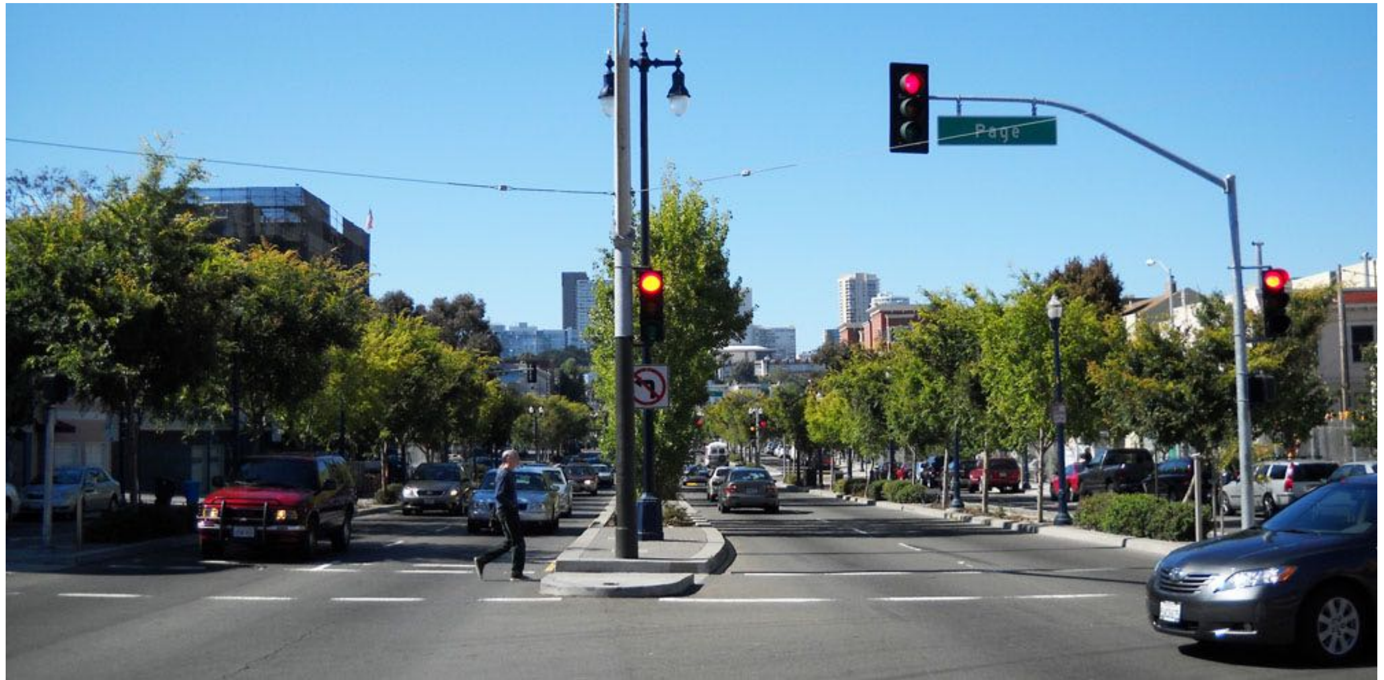
Octavia Boulevard, San Francisco