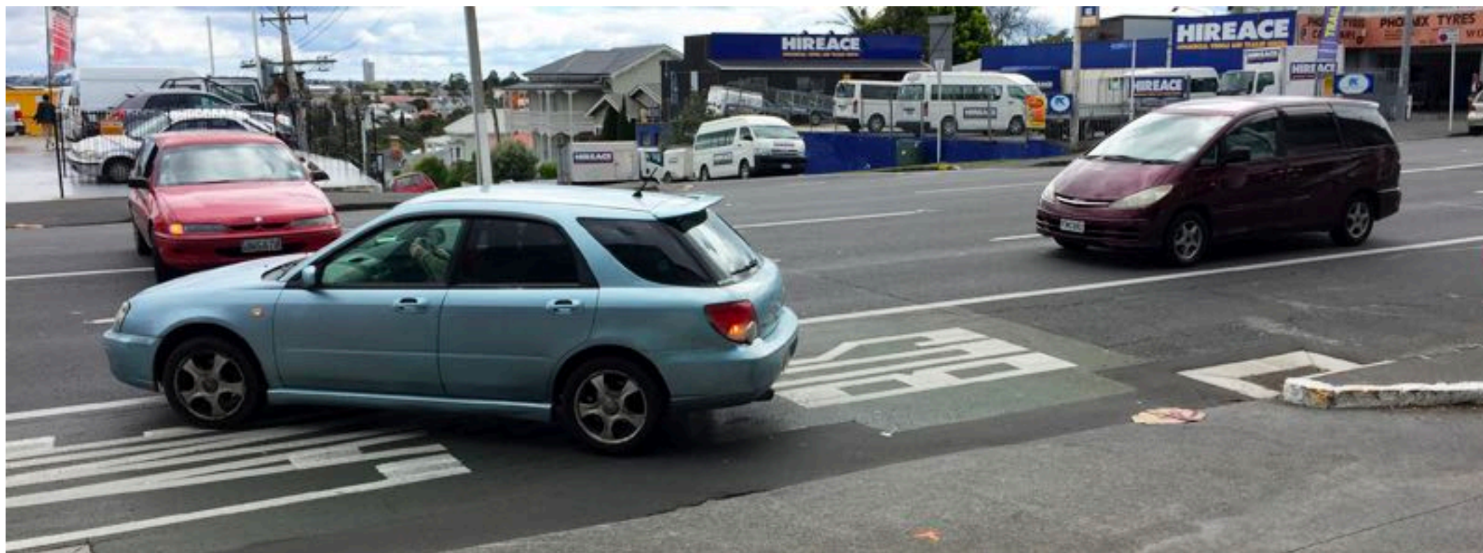
Total chaos with cars exiting both Bunnings & Repco into traffic.